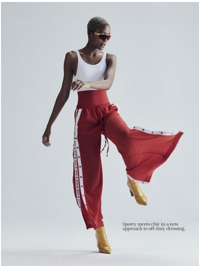
Sporty meets chic in a new approach to off-duty dressing.