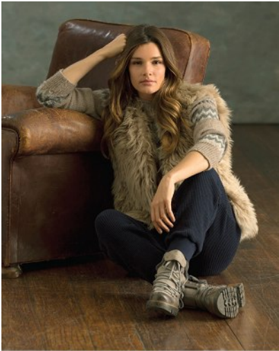
Himalayan Gilet £395 | Alpaca Fair Isle Funnel Neck £175 | Agnes Ski Boots £175