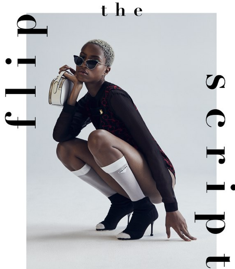
Styling by RUSTY BEUKES