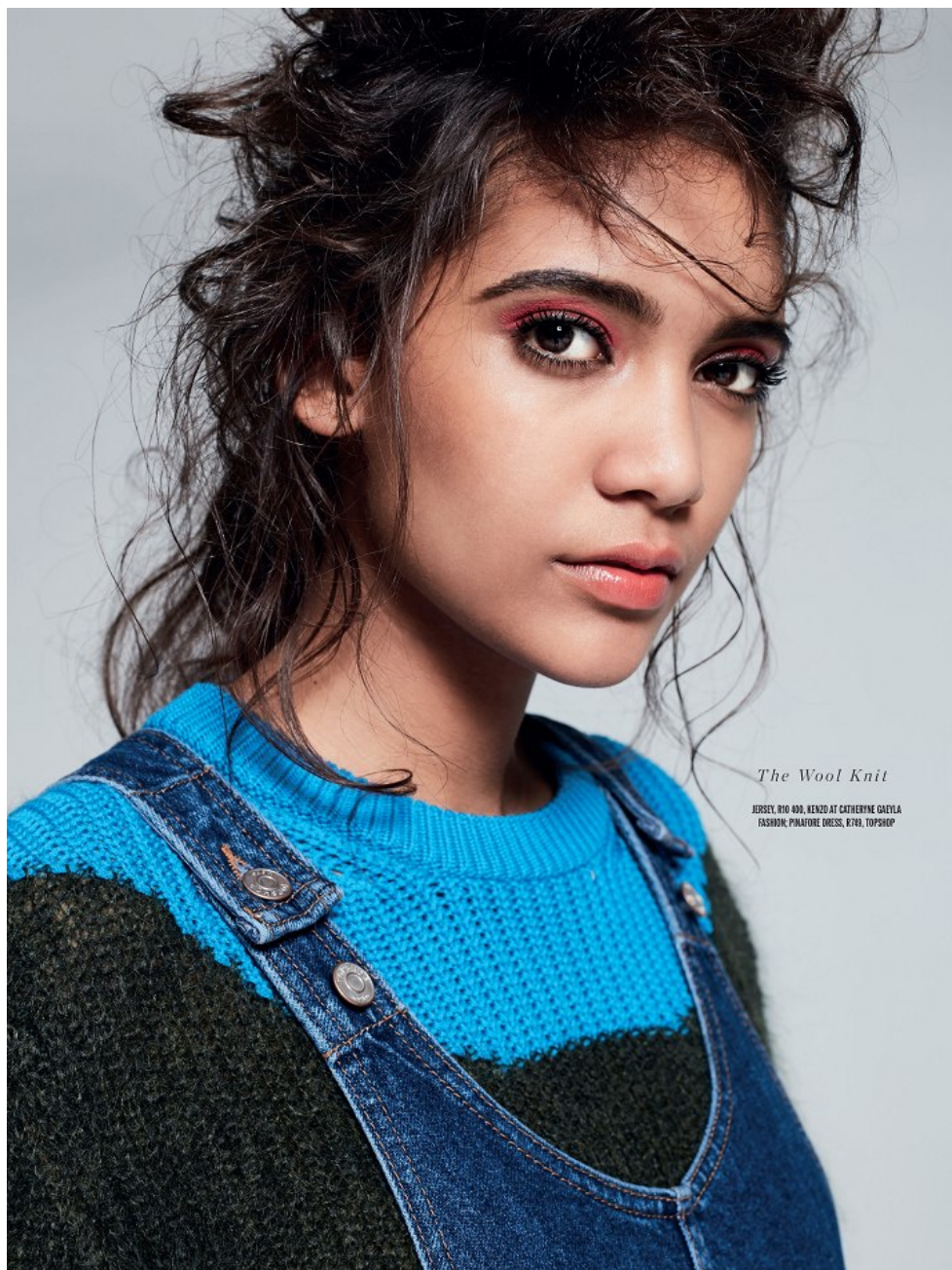
The Wool Knit

JERSEY, R10 400, KENZO AT CATHERINE GAYLEA FASHION, PINAFORE DRESS, R140, TOPSHOP