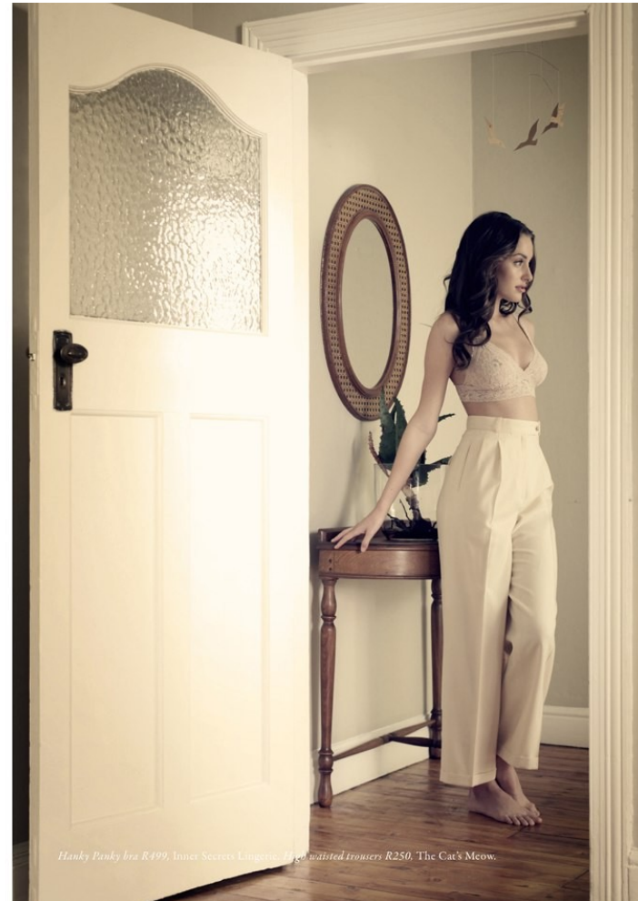
Hanky Panky bra R499, Inner Secrets Lingerie. High-waisted trousers R250, The Cat's Meow.