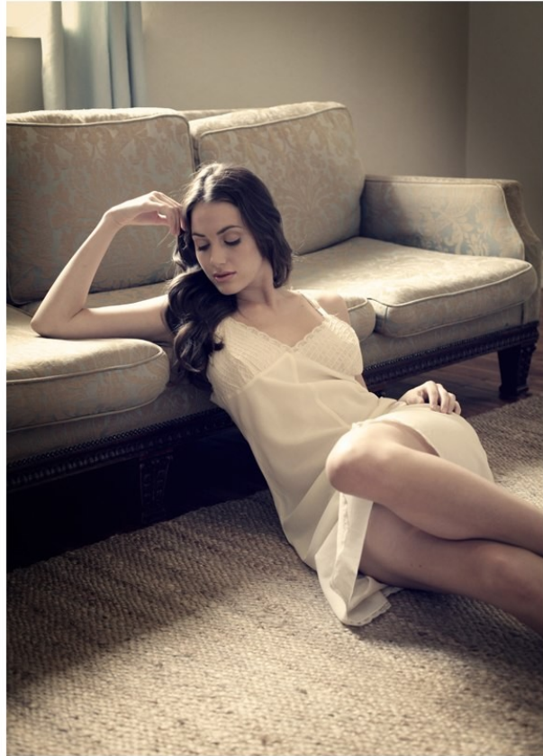
Vintage negligée R200, The Cat's Meow.