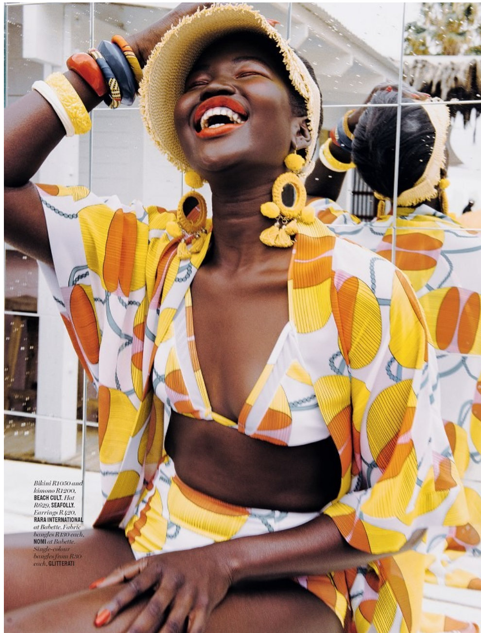
Bikini R1050 and kimono R1200, BEACH CULT. Hat R620, SEAFOLLY. Earrings R420, BARA INTERNATIONAL at Babette. Fabric bangles R180 each, NOMI at Babette. Single-colour bangles from R30 each, GLITTERATI