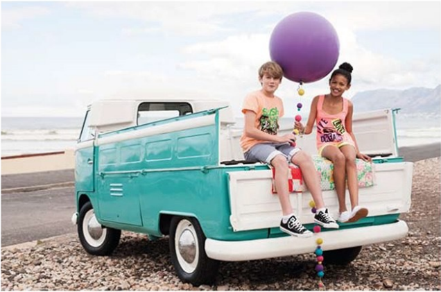
october 2013 09