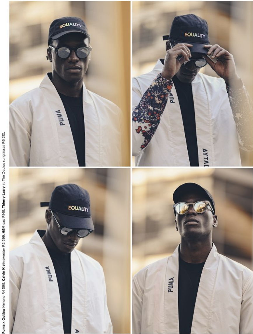
Puma x Outlaw kimono R4 599, Calvin Klein sweater R2 699, H&M cap R149, Thierry Lasry at The Oculus sunglasses R6 210.